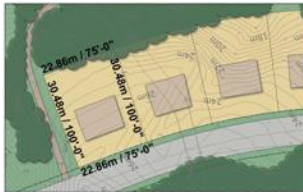
Typical home placement on lot